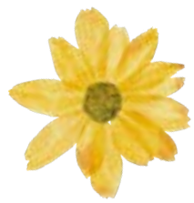
Oman - Honourary Demonstration – Sabra Mugari