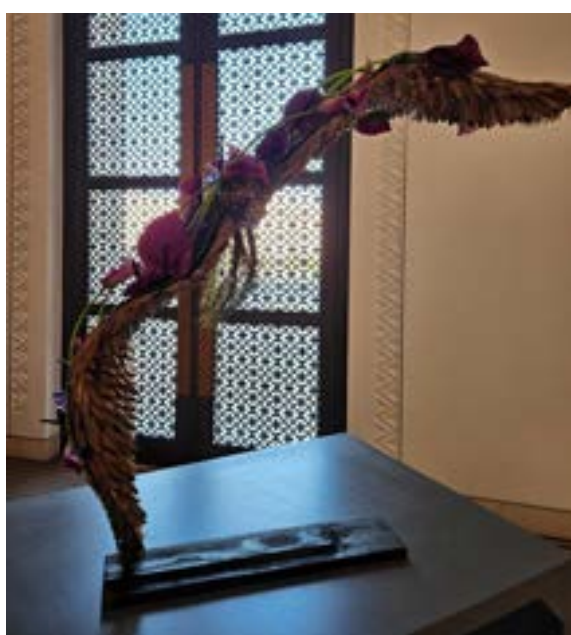
New Zealand – Honourary Demonstration – Leigh Greenstreet (Bird in Flight)