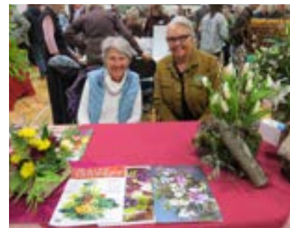
Mid-Island participated in Seedy Saturday and had a wonderful time